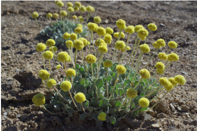
Eriogonum lewisii - Lewis' wild buckwheat