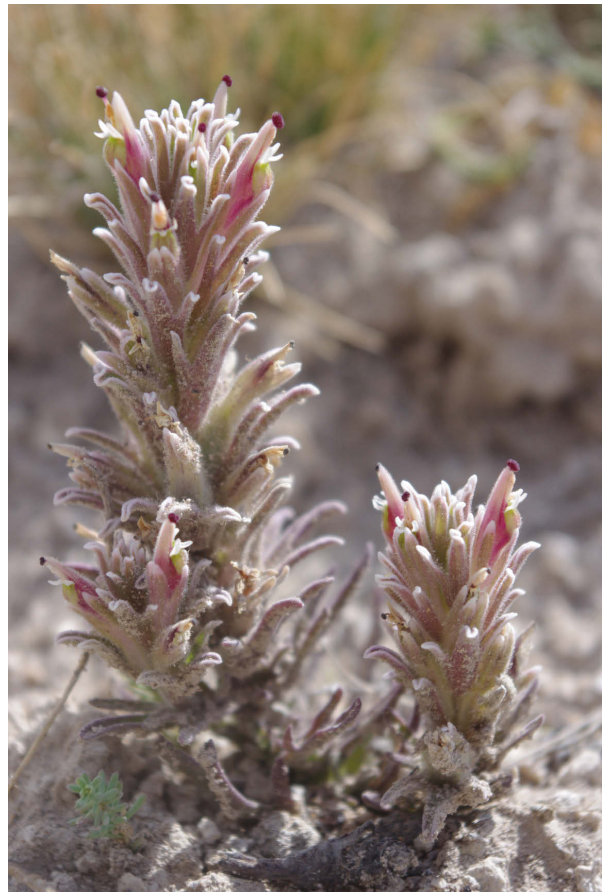
Castilleja salsuginosa

Phacelia minutissima , least phacelia Phacelia parishii , Parish phacelia Polycytenium fremontii var. bisulcatum , Silvies Valley combleaf Polycytenium williamsiae , Williams combleaf Potentilla basaltica , Soldier Meadow cinquefoil Rorippa subumbellata , Tahoe yellowcress Sisyrinchium funereum , Death Valley blue eyed grass Sisyrinchium radicum , Saint George blue eyed grass Solorina spongiosa , fringed chocolate chip lichen Spiranthes diluvialis , Ute ladies tresses Spiranthes infernalis , Ash Meadows lady's tresses Synthyris ranunculina , Charleston kittentails