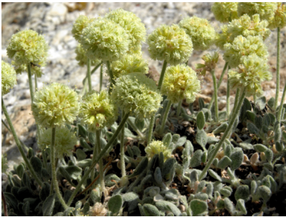
Eriogonum kingii - Ruby Mountains wild buckwheat