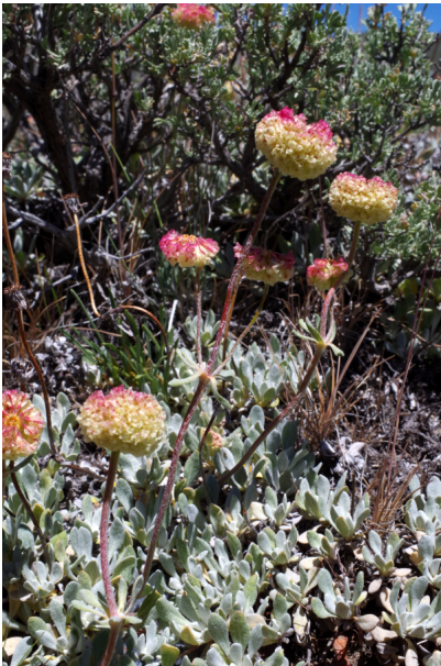
Eriogonum douglasii var. elkoense - Sunflower Flat wild buckwheat

The Eriogonum Society was founded to promote the conservation and appreciation of our wild buckwheats both in the garden and in the wild. This year we will be exploring the wild buckwheats of Elko County, including rare and endemic species.